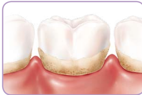
Plaque and tartar build-up