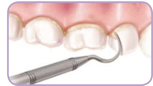
Scaling removes plaque and tartar

Brushing and flossing help clean the plaque from your teeth. But you can't remove tartar at home. During the cleaning, your dental professional will use special tools to remove tartar. This is called scaling .