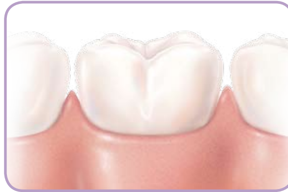
Healthy teeth and gums

The check-up should also include your tongue, throat, face, head and neck. This is to look for any signs of trouble, swelling, or cancer.