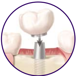
After the anchor has been inserted, the false tooth is put into place