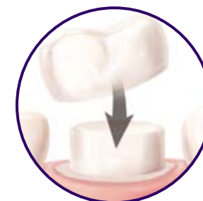
The crown is cemented into place over the damaged tooth