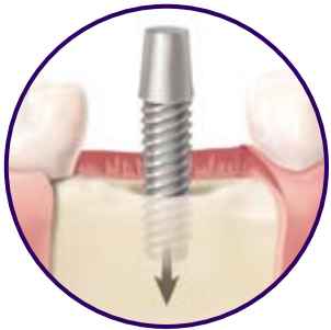
The metal anchor is inserted into the jawbone

Dental implants are used to replace missing teeth. An implant has 2 parts: a metal anchor and a false tooth. A dental implant looks and feels like a natural tooth.