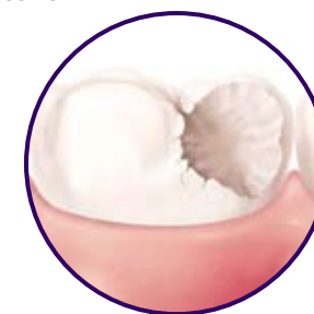
A crown is ideal for people with broken teeth or cavities

A crown is a tooth-shaped cap that is placed over a tooth. It is used to strengthen and protect your tooth structure. Crowns are either made of precious metal which may be veneered or of a hard, white substance (ceramics) to help them look natural.